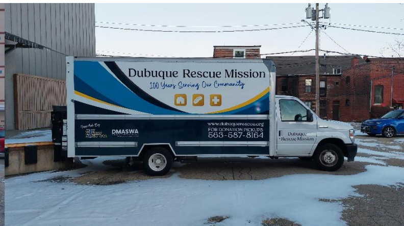
Our second truck with new wrap, thanks to Dubuque Metropolitan Area Solid Waste Agency and Big River Sign Company.