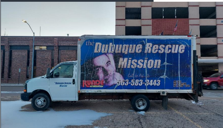
Our truck with cracked, peeling wrap, will cost $5,000 to replace.

Our trucks are used for picking up and delivering donations and purchases from our thrift stores, serving as a key fundraising tool for our organization.